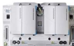
Ovation system DCS card Westinghouse system control module