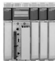
Quantum series PLC module system