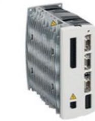
AC800M controller IO module AC800F, AC31 controller module