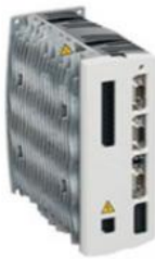
AC800M controller IO module AC800F, AC31 controller module