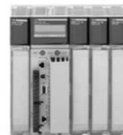
Quantum series PLC module system