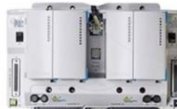
Ovation system DCS card Westinghouse system control module